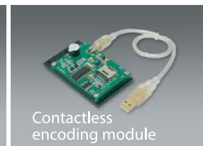
Contactless encoding module