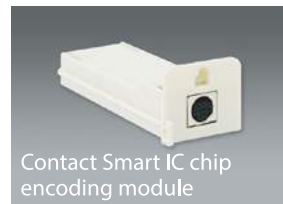
Contact Smart IC chip encoding module