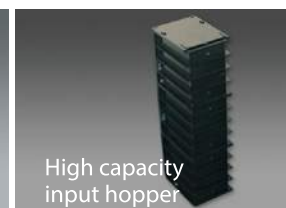
High capacity input hopper